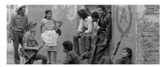
ERP COMBATANTS IN PERQUÍN, 1990.

In the 1980s, El Salvador was ravaged by a bitter civil war stoked by gross inequality between the overwhelming majority of the population and a small and wealthy elite. Around 70,000 people died in the conflict.