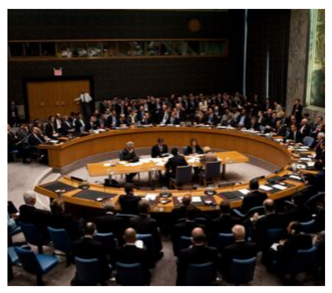
A UNITED NATIONS SECURITY COUNCIL MEETING

In line with tradition, Brazil spoke first, and if anyone thought the language could not get any more nationalistic and right wing, they were in for a big surprise when it came to the speech delivered by the Hungarian Foreign Minister, Péter Szijjártó, which would have been more at home in Nazi Germany of the 1930s than in New York of the 21st century. Whilst most of the nations declared their allegiance to multilateralism as a means of facing the serious challenges ahead, Hungary put its middle finger up to it in a speech laced with venom and racism. Mr. Szijjártó was also scathing about the United Nations itself and announced that Hungary would tear up any UN directives regarding immigration.