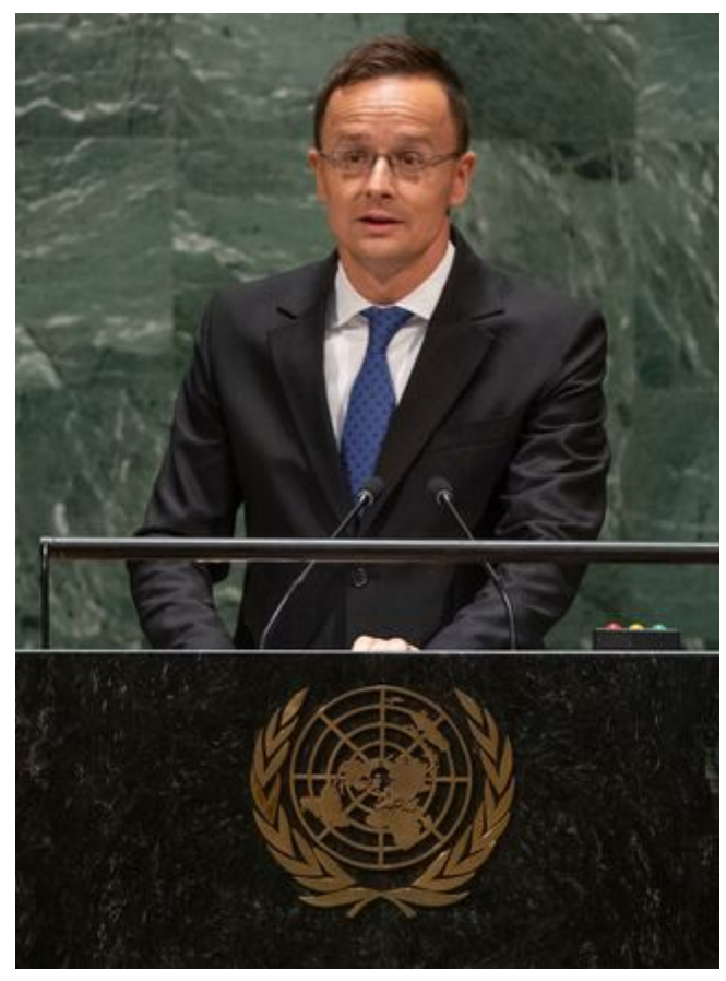
PÉTER SZIJJÁRTÓ, HUNGARY'S MINISTER OF FOREIGN AFFAIRS