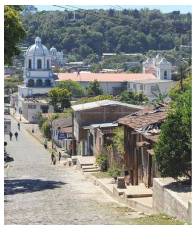
A VILLAGE IN EL SALVADOR

Mr. Bukele's statement comes at a time where the UN is repeatedly being condemned for its ineffectiveness in dealing with global problems.