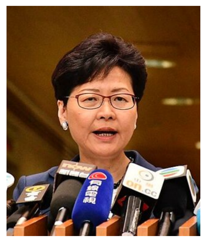
CHIEF EXECUTIVE CARRIE LAM AT THE PRESS CONFERENCE

For criminals to be eligible for extradition to mainland China, they must be found guilty of one of the 37 internationally recognized crimes with a sentence of 7 years or more... All extradition cases must be vetted by the Hong Kong Special Administrative Region (HKSAR) court and the chief executive of Hong Kong. The bill clearly stipulates that there are "eight un-transfers". Cases where extradition is not permitted include: political crimes, situations relating to journalism, freedom of speech, academic publications, and the risk of the individual facing the death penalty.