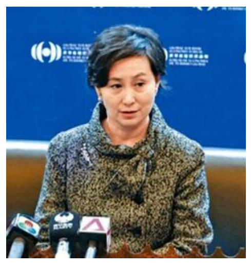
PANSY HO CHIU-KING

As Pansy Ho Chiu-king, chairwoman of the Hong Kong Federation of Women, said in a speech at the 42nd session of the UN Human Rights Council: I felt puzzled why western media never reported on the fear caused by the riots among the ordinary people living in Hong Kong.