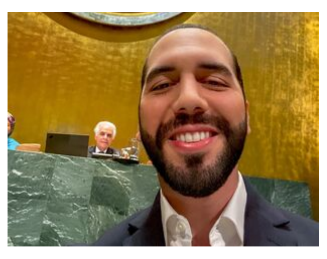
WITH A SELFIE, EL SALVADOR'S LEADER URGES UN TO EMBRACE TECH

Describing a viral video that recently drew attention to the needs of a village in El Salvador, he said everyone can now have a voice through their smartphones.